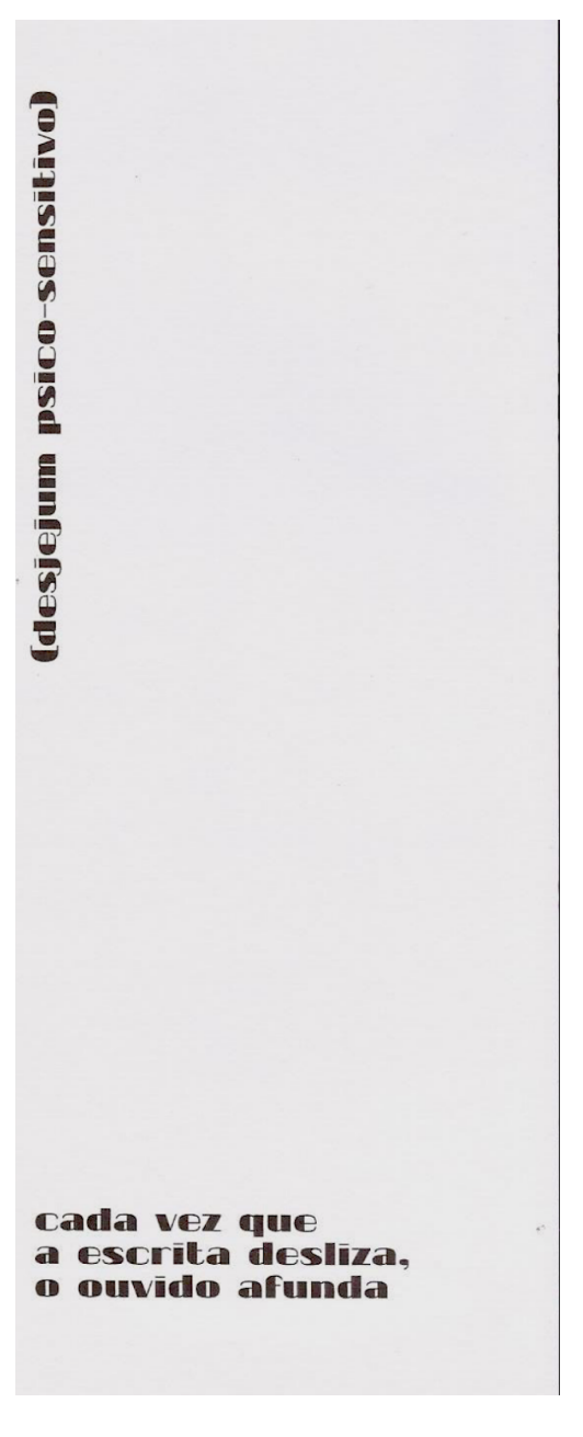
FIGURE 3 – Desjejum psico-sensitivo [Psycho-sensitive breakfast]. Graphic material from Mar Paradoxo , by Raquel Stolf. This rectangular sheet of paper contains the following texts: "(psycho-sensitive breakfast)", written vertically at the top of the page; and "each time the writing slides, the ear sinks", written horizontally at the bottom of the page.

experience, incarnated. Therefore, the texts we produce demonstrate, each in its own way, both form and language sliding towards a more liquid, slippery type of writing. The reports are soaked in metaphors and other style and language resources that contribute to the construction of narratives that escape literality and that invite us to dive into a collective imaginative exercise.